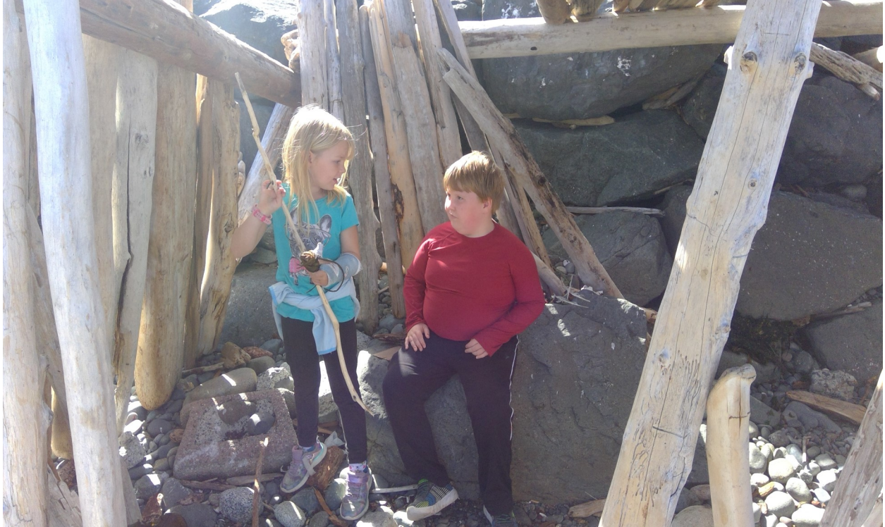
Mme Flora's class exploring the beach and forest