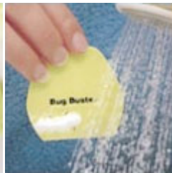
Rinsing the comb of lice