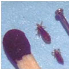
Head lice next to a pin and matchstick to show scale