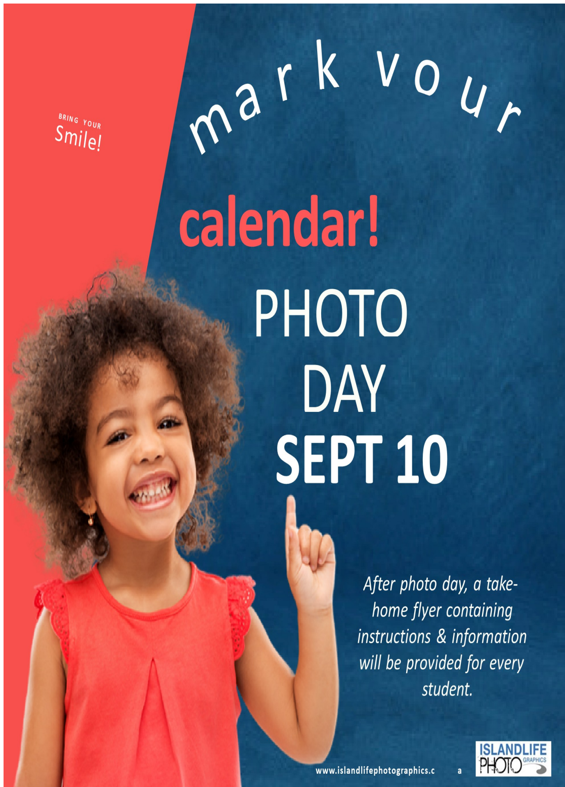
Photo Day will be on September 10th with the exception of Mme Ross & Mme Kala's Kindergarten students. They will have their photo day on September 22.