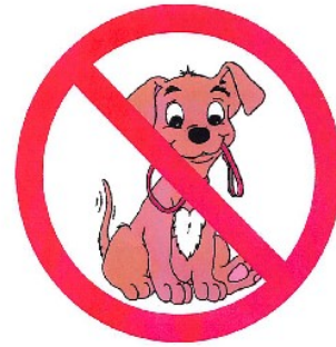
Dog Free Zone