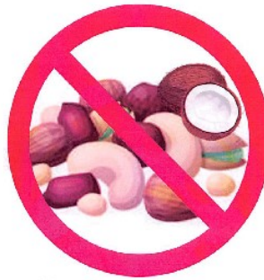
Nut Free Zone

In the meantime, please note these restrictions for the school.