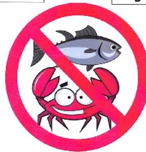
Seafood Free Zone