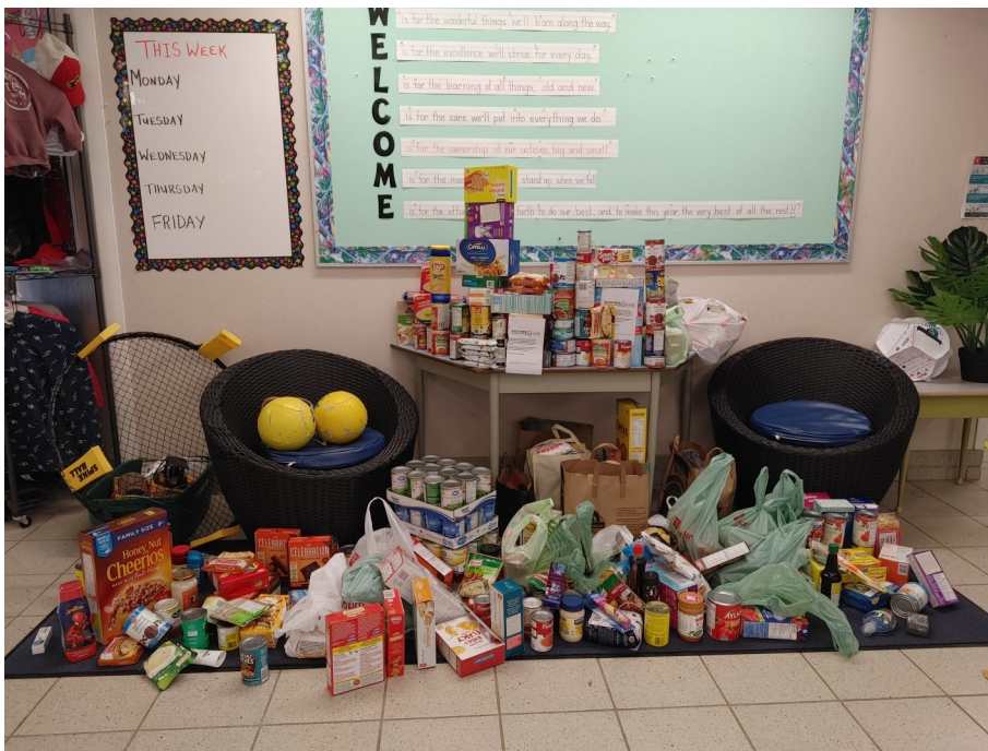
Items collected from our Thanksgiving Food Drive.