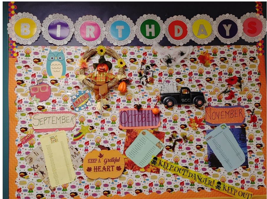
Our awesome Birthday Board created by our parent volunteers.