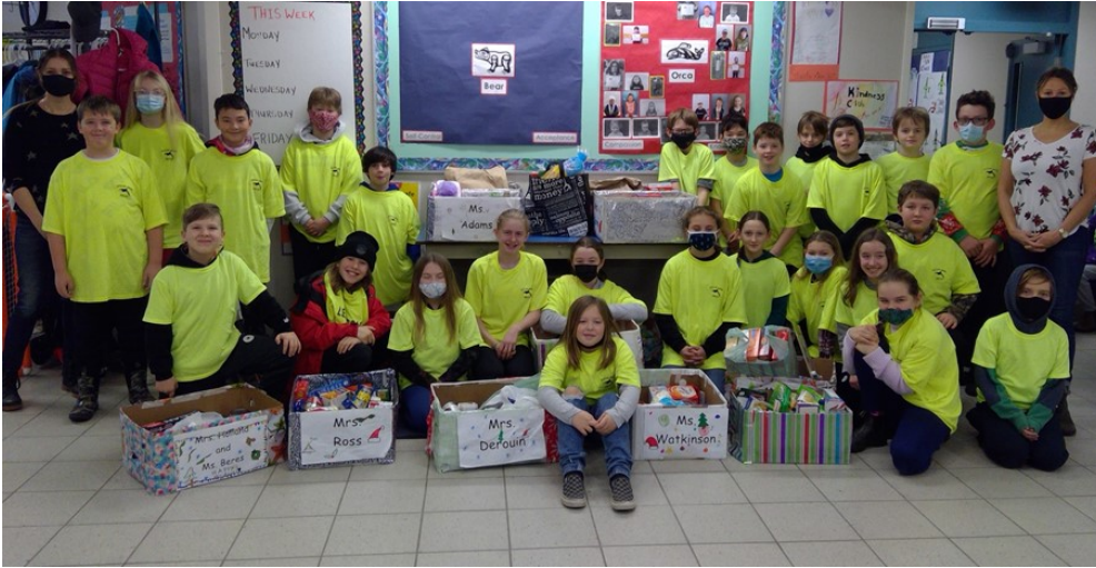
Grade 5 Leadership Students with Knights of Columbus Hamper donations.