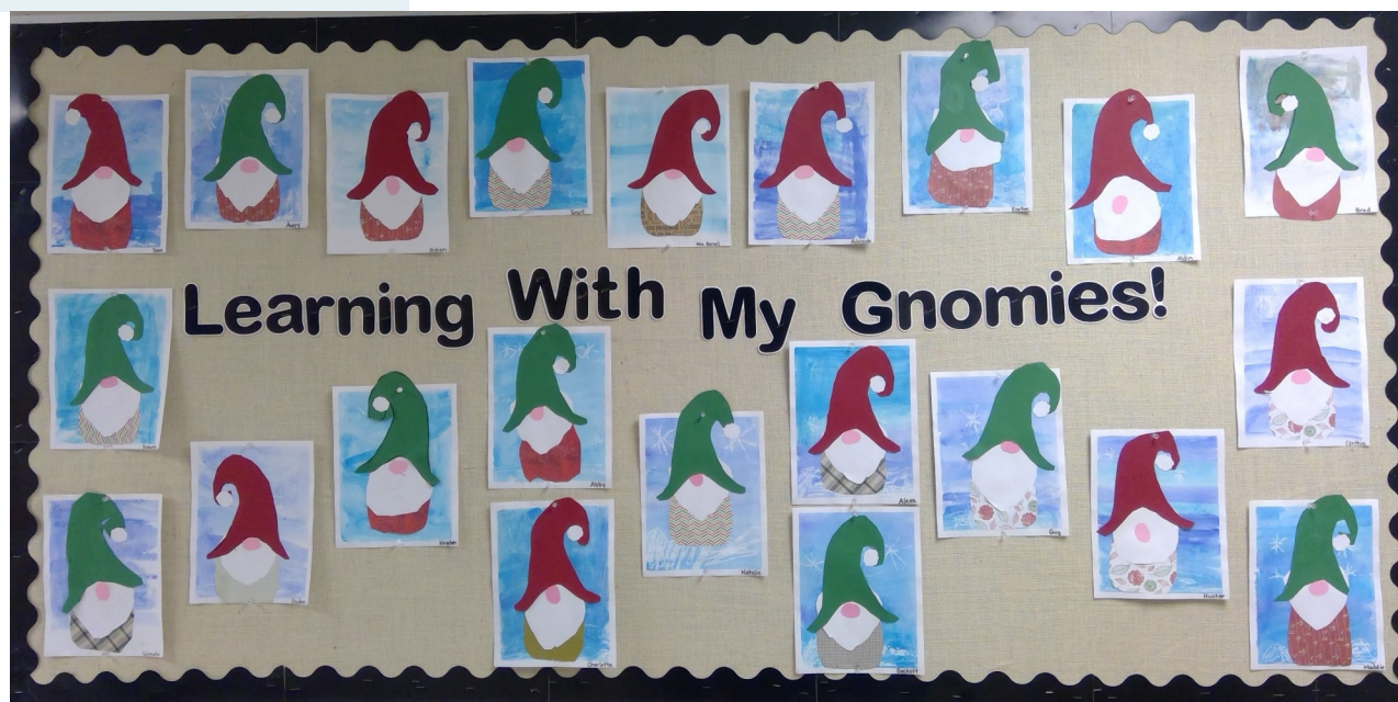
Mrs. Farrell's grade K/1 classroom art posted in the hallway.