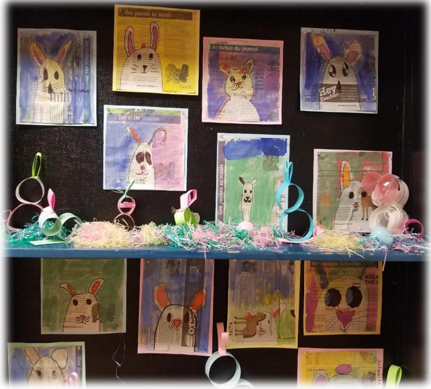
Smile of the Month #2