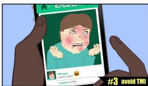
#3 Avoid TMI