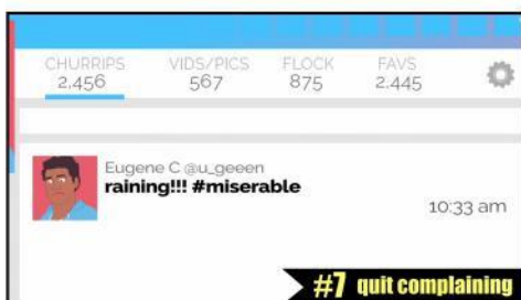
#7 Quit complaining