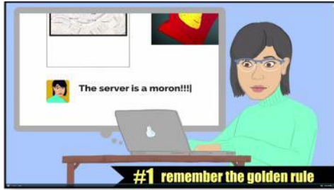
#1 Remember the golden rule