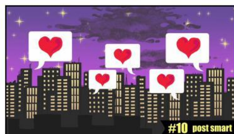
#10 Post smart