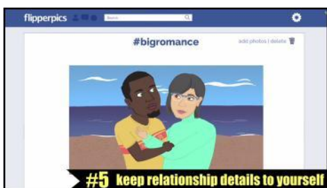
#5 Keep relationship details to yourself