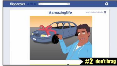
#2 Don't brag