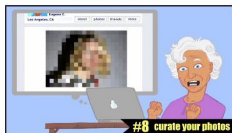
#8 Curate your photos