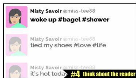
#4 Think about the reader