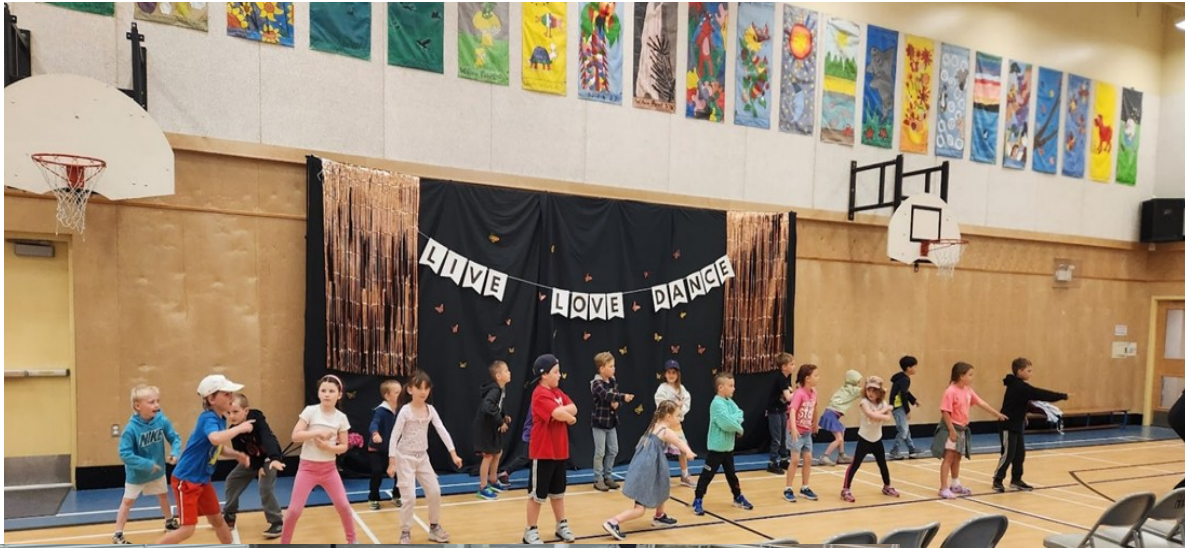
Mme Kala's class performing their Hip Hop routine .

Parents and students pitched in to get our new "Community Garden" started.