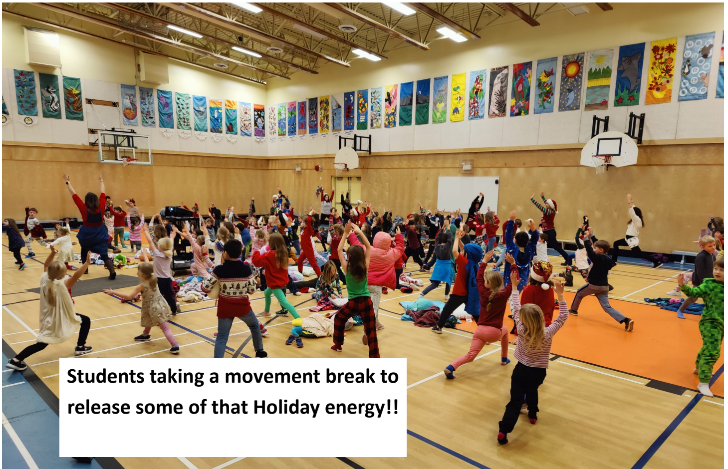
Students taking a movement break to release some of that Holiday energy!!