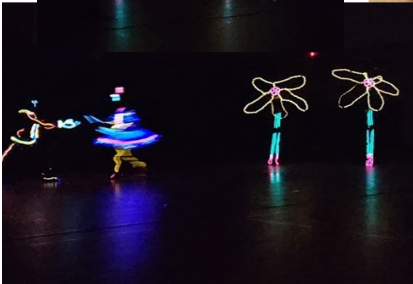
iLumiDance performance at our school by Rainbow Dance Theatre.