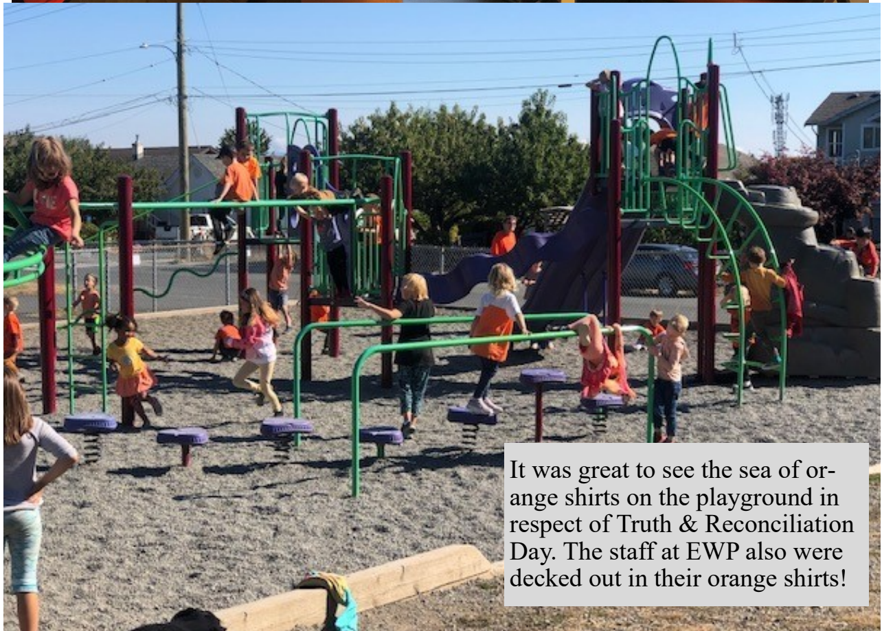
It was great to see the sea of orange shirts on the playground in respect of Truth & Reconciliation Day. The staff at EWP also were decked out in their orange shirts!