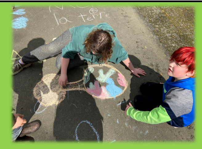
BIG BUDDIES ~ MME JENNY/MME HWANG'S WITH MME DAVIS/MME DALLAIRE'S CLASS